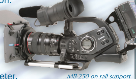
Kit # WS-CS